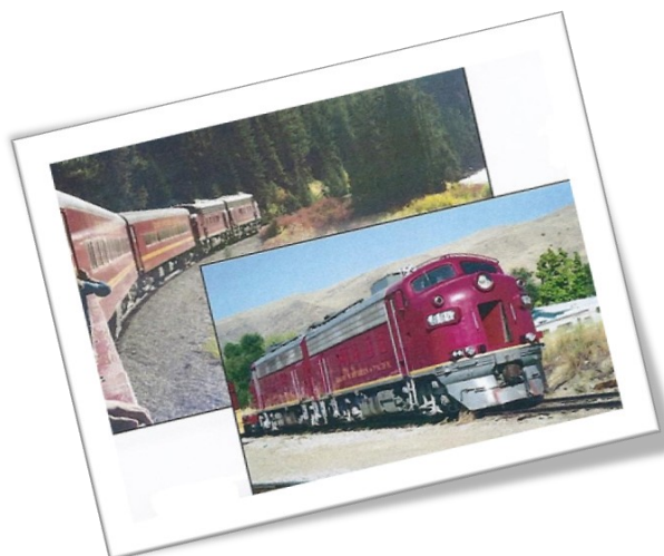
Thunder Mountain Line– Travel the old rails beside crystal clear mountain streams. See white water rafters coming down the rapids. The train stops at the half way point and serves lunch and drinks with some old live western music for entertainment . See more on their website at www.thundermountainline.com

Checkout our website for more details and up to date events that will be available for all visitors coming to Boise..... www.tvdmcl.org