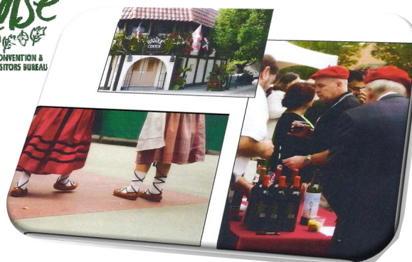
Authentic Basque Party and good wine- Checkout the website at www.basquemuseum.com